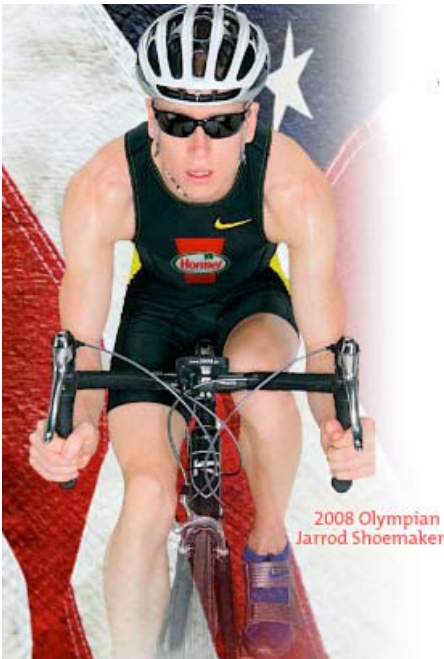
2008 Olympian Jarrod Shoemaker